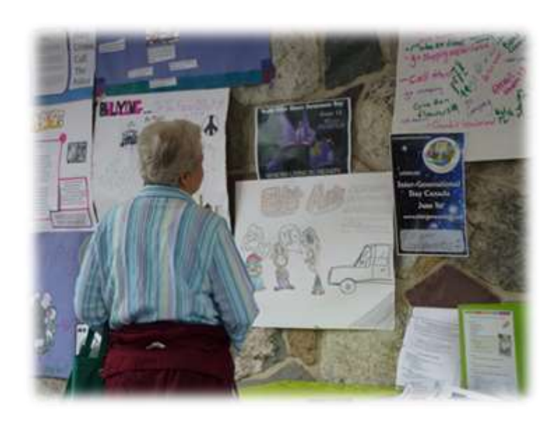
"Bridging the Gap" project by Revelstoke teens.