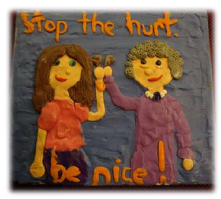
Plasticine poster on bullying done by an 8-year old.