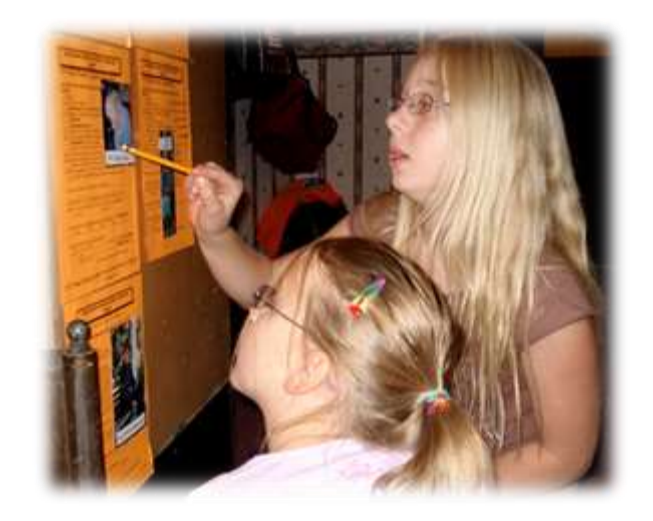
10-year old teaching her little buddy about her senior buddy.