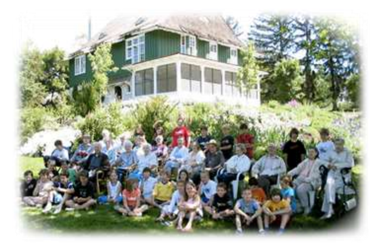
Build an intergenerational community by being an intergenerational community: Meadow School Project, Coldstream, BC.

Regroup to fine tune and continue your project.