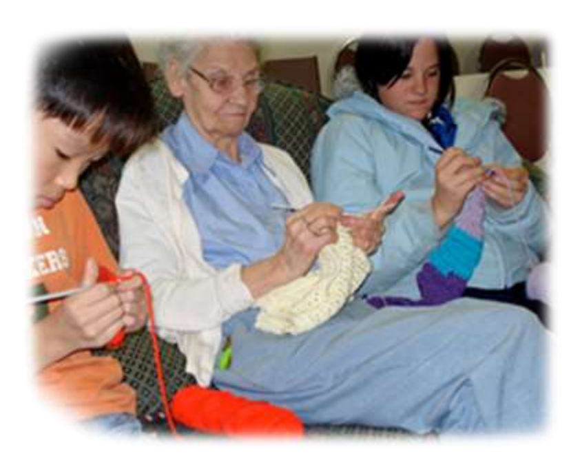
Multiple generations crocheting together.

As with most social initiatives, it is difficult to evaluate intergenerational initiatives quantitatively. Yet, anyone participating in successful intergenerational projects knows that qualitatively, intergenerational orientations can be highly successful.