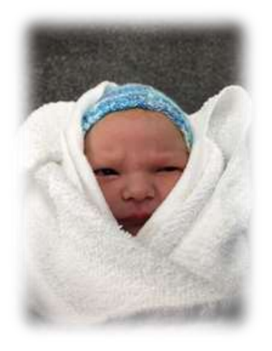
"Well at 30 minutes old, it's all pretty new to me! I'm just happy to get started."

How do you feel about the above comment? Do you have a comfort zone with older and younger generations?