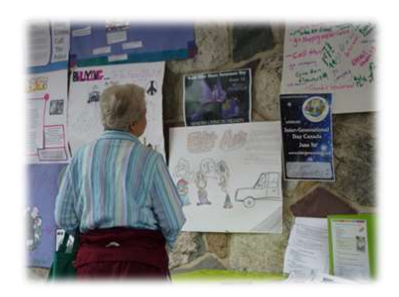
"Bridging the Gap" project by Revelstoke teens.