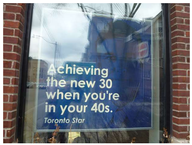
So, what's wrong with being 40?

Older relatives receive invitations to attend family events, yet they sit alone as participant-observers, not co-participants. Few attendees take the time to chat, or make an effort to connect one-on-one. And then there are other older persons who have no family or friends to invite them, no one to talk with, and certainly no access to younger people for a visit or to share a moment or a memory.